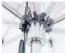
Patented Independent Bracket Hub System