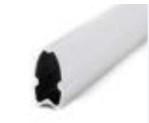
V-MAX Reinforced Strut Design