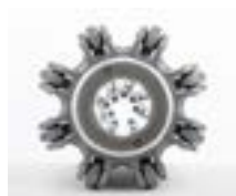
Easily Replaceable Parts