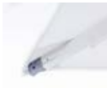
Ballistic Reinforced Screw Pocket Construction