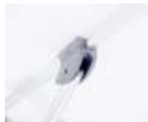
Reinforced Strut Joint Connector