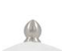
MAX Acorn Finial