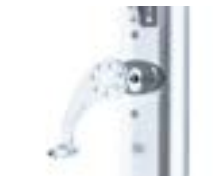
Telescoping Mast with EasyDrive Crank Lift System