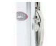
Cam Lock Lever - Allows 360° Rotation