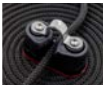
Auto-Loc Marine Pulley System