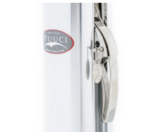
Cam Lock Lever - Allows 360° Rotation