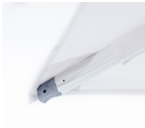
Ballistic Reinforced Screw Pocket Construction