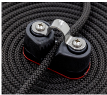
Auto-Loc Marine Pulley System