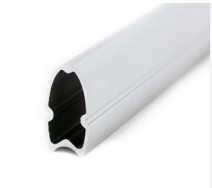
V-MAX Reinforced Strut Design