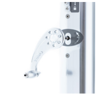
Telescoping Mast with EasyDrive Crank Lift System