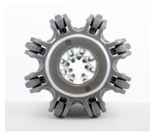
Easily Replaceable Parts