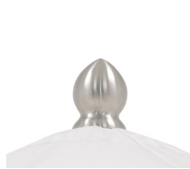
MAX Acorn Finial