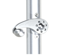
Easy Drive Crank Lift System