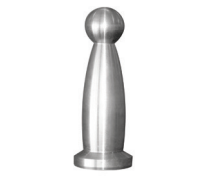
Venice Aluminum Finial