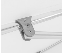
Reinforced Strut Joint Connector