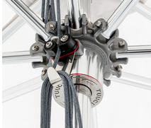
Patented Independent Bracket Hub System