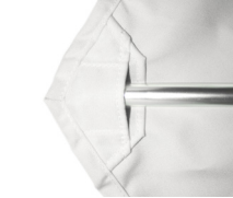
Ballistic-Reinforced Canopy Construction