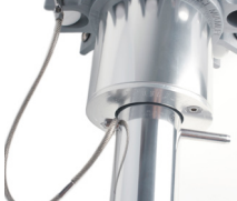
Manual Lift w/ Stainless Steel Security Pin