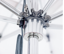
EasyDrive Crank Lift System